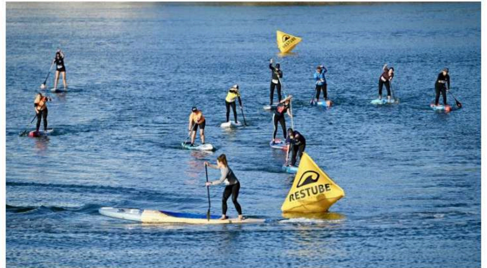
Paddleboard World Cup in Torbay